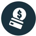
Asset Based Lines of Credit