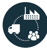
Supply Chain Financing