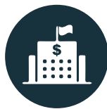
Floor Plan Financing